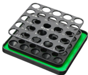
Adapters : 2ml X 24