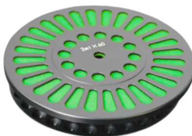
Adapters : 2ml X 60